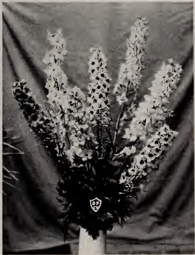
DELPHINIUMS. Fine English strains in rich colors. 6 for $1.25.